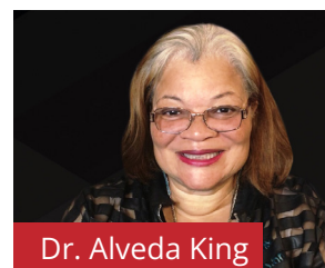
Dr. Alveda King