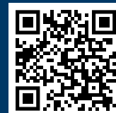
Scan to visit site

Join us every Tuesday at 1 PM ET Learn More at NextStepsForward.com