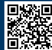
Scan to visit site

Join us every Tuesday at 1 PM ET Learn More at NextStepsForward.com