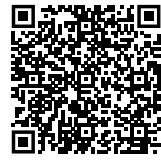
Scan to visit site

Are you looking for a way to create a legacy to honor those who fought and defended our freedoms? SoldierStrong is excited to share a secure online tool to help you support our efforts to provide revolutionary medical technologies to better the lives of veterans through a stock donation. Learn more about how your stock can benefit our work and your savings!