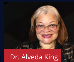
Dr. Alveda King